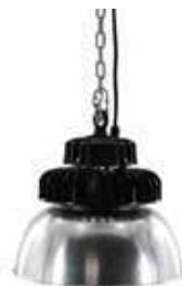
90° Aluminium Reflector