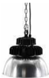
60° Aluminium Reflector