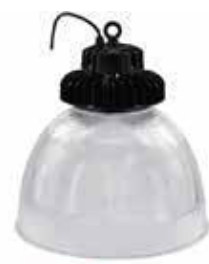
70° Clear PC Reflector