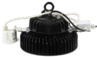
IP65 Microwave & Daylight Sensor (Junction Box Included)