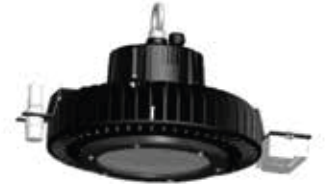
Daylight + Motion Sensor